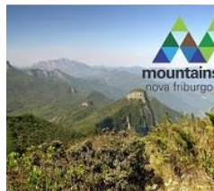
Mountains 2018 organizers call for input

The Russian Academy of Natural Sciences (RANS), a Mountain Partnership member in General Consultative Status with the United Nations Economic and Social Council (ECOSOC), contributed a written statement on behalf of the Mountain Partnership to the