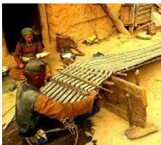
Eradicating poverty in mountains

The Russian Academy of Natural Sciences (RANS), a Mountain Partnership member in General Consultative Status with the United Nations Economic and Social Council (ECOSOC), contributed a written statement on behalf of the Mountain Partnership to the