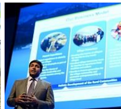
Global Himalayan Expedition wins tourism award

Mountains 2018 is the second in a series of international conferences that will bring together scholars, professionals, policy-makers and other stakeholders from the mountain world. The conference seeks to stimulate discussion and disseminate knowledge about