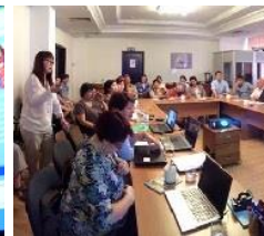
Central Asian mountain stakeholders meet

Global Himalayan Expedition (GHE), a Mountain Partnership member from India, won the Start-Up Innovation Award for the category of “impact tourism” at the fifth World Tourism Forum Lucerne in Lucerne, Switzerland on 4–5 May 2017. GHE earned this prize for their business model of